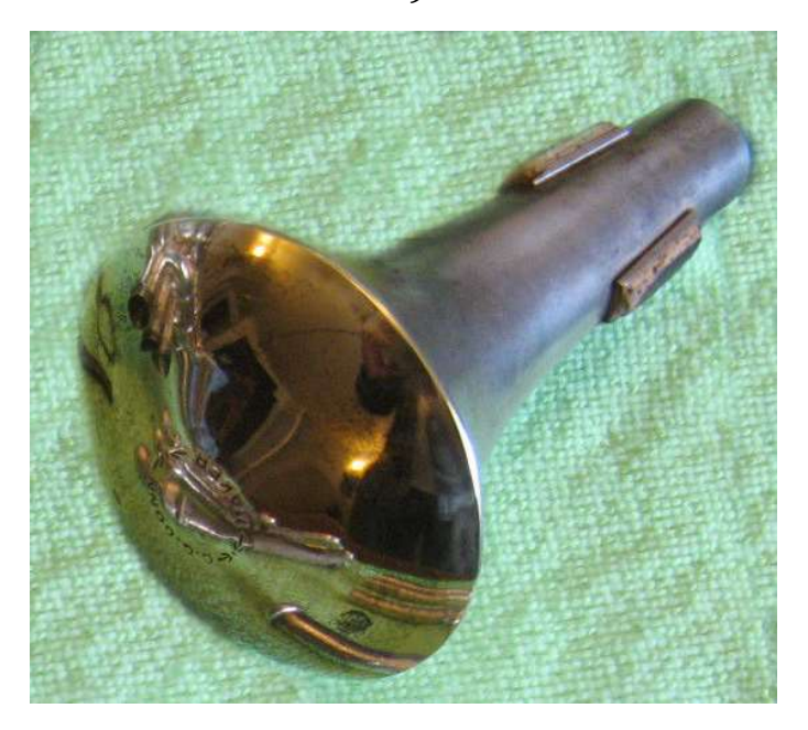
Conn Wonder mute with domed end.

Here is a mute that came with a 1911 cornet.