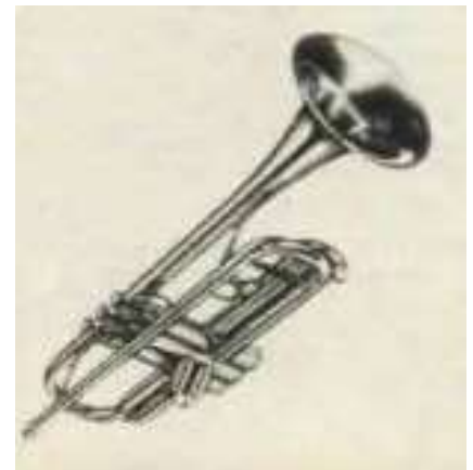
1966 Kadit and Grenadier models (top right) 1970 Kadit and Grenadier models (middle right) The last trumpet offered in 1980 (bottom right)